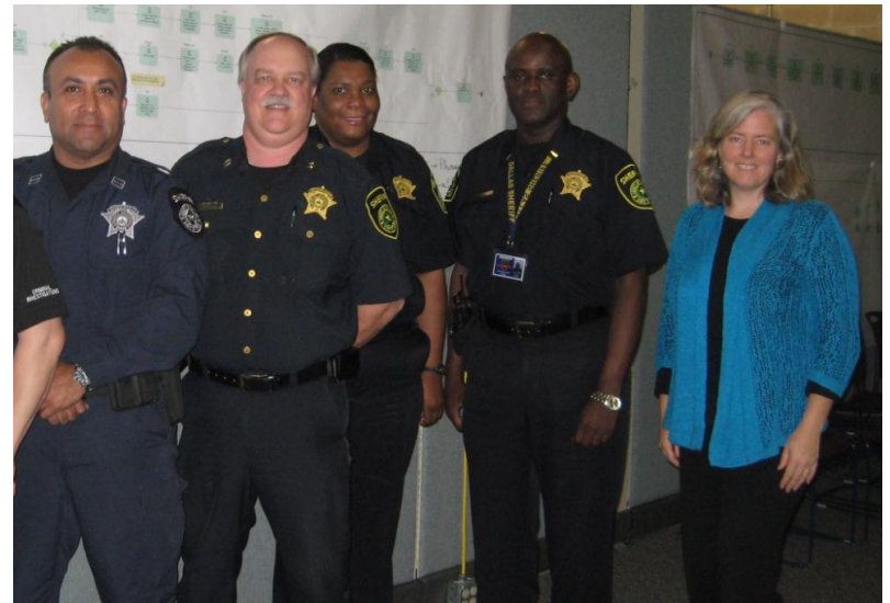
JDI and Dallas County Sheriff's Office staff.