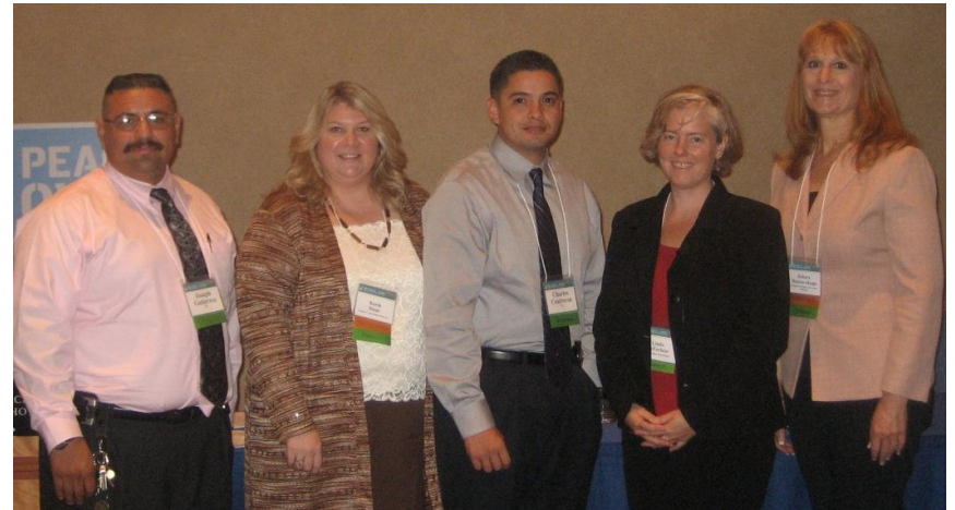
Paths to Recovery Team in a California prison