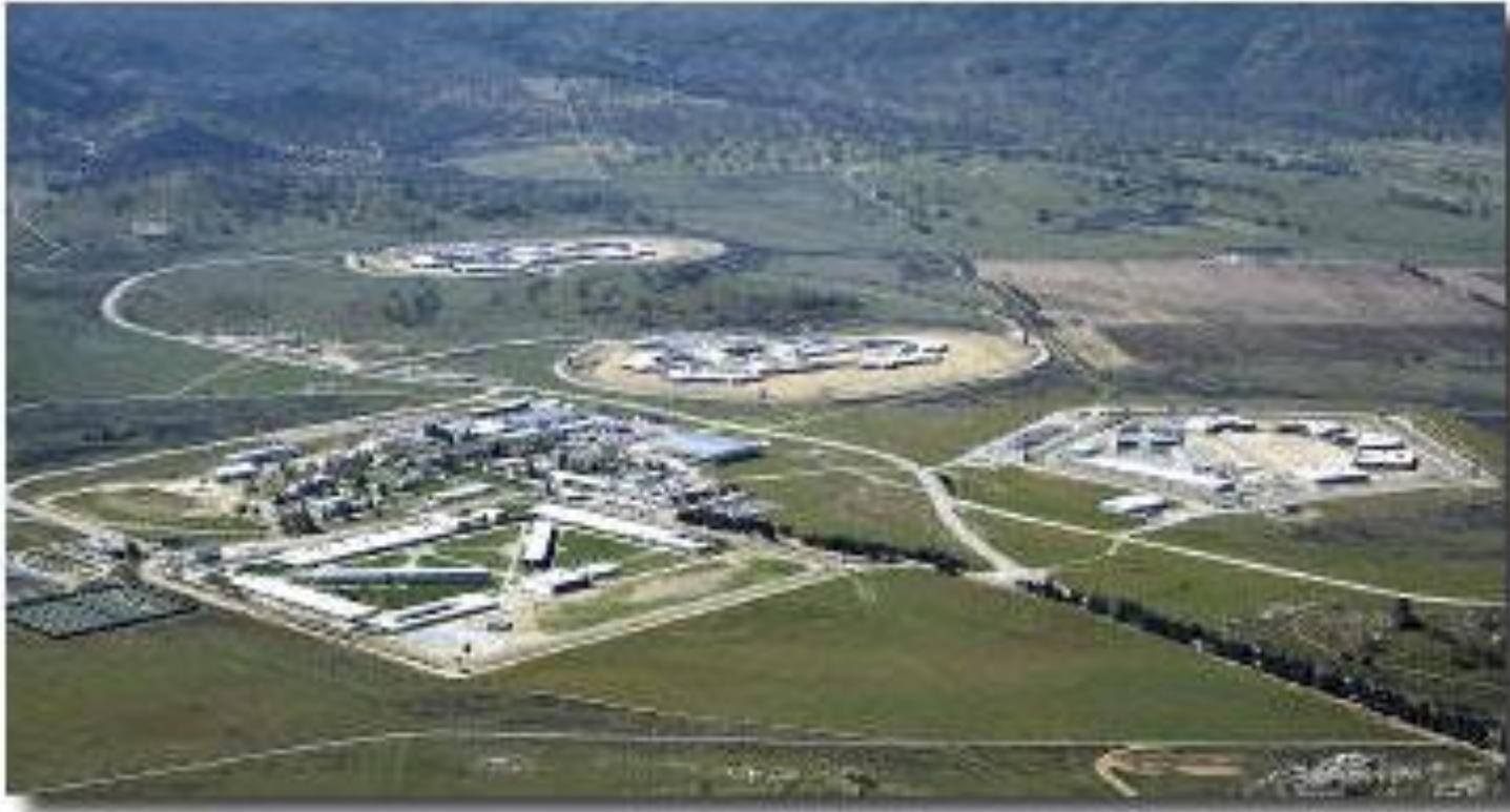
California Correctional Institution, Tehachapi, CA