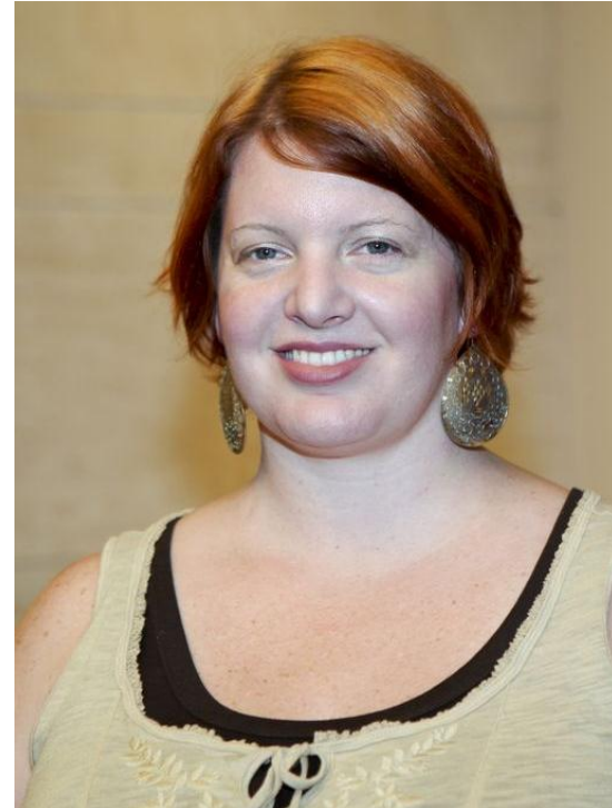
Hope, survivor of sexual abuse in detention