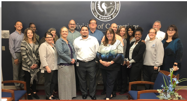
The audit team with the Sedgwick County Juvenile Detention Facility leadership.

These investments have been developed strategically to ensure that the PRC and PMO are able to track and count audits, keep up with auditor activity, and evaluate processes in order to feed back into training and other initiatives, such as resource development,