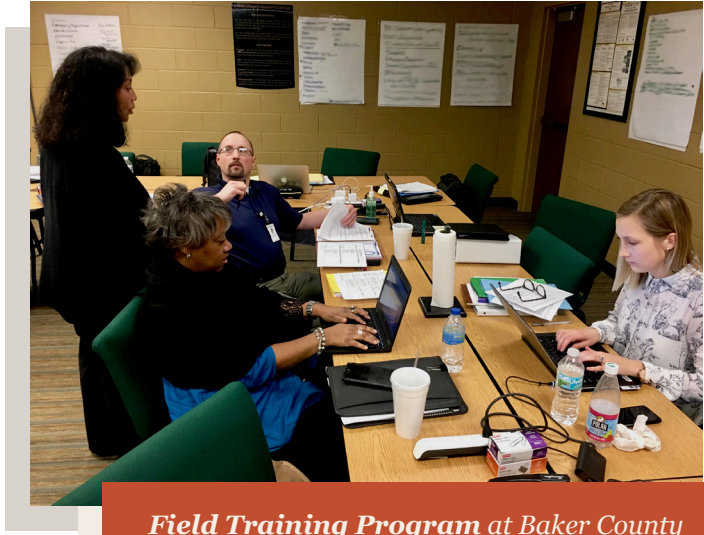
Field Training Program at Baker County Detention Center, February 2018.

A crucial component of PREA implementation is the DOJ PREA audit function. The PRC continues to oversee this function in assisting with the training, support, and oversight of PREA auditors around the country. In collaboration with its DOJ partners, the PRC works to ensure the quality and integrity of auditors' work, utilizing data analysis, technology, and peer review systems. Through a multi-disciplinary program that encompasses training, recertification processes, and robust feedback, the PRC continues to make tremendous strides toward sexual safety in confinement.