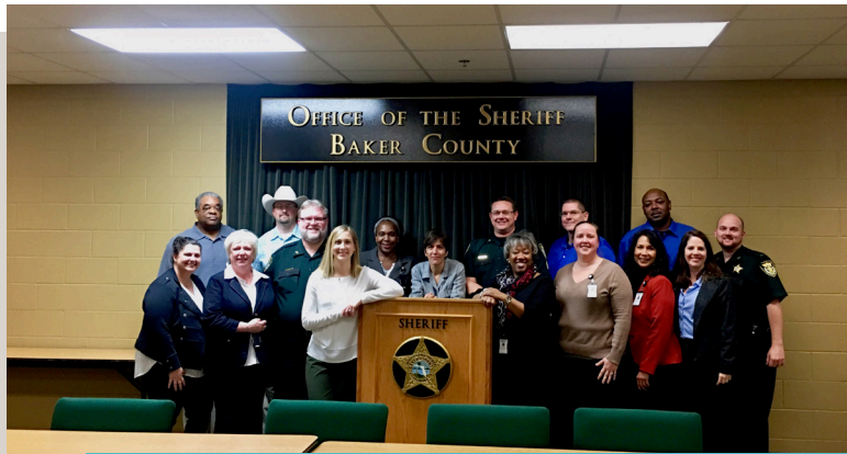
PRC staff and auditor trainees at the Baker County Detention Center FTP in Macclenny, FL in February, 2018.

The PRC's capacity continues to grow under the stewardship of PMO. This past year has seen the realization of many goals that were set in the past but the PRC and the field have only now become ready to see them achieved. The PRC's mini-grant program, advanced technical assistance initiative, the roll-out of the Standards in Focus series, and advanced planning for the PREA Academy, are all investments that were made this year in fidelity to the PREA standards and its goals—prevention, detection, and response to sexual abuse in confinement—and also the long-term sustainability of the progress that has already been made.