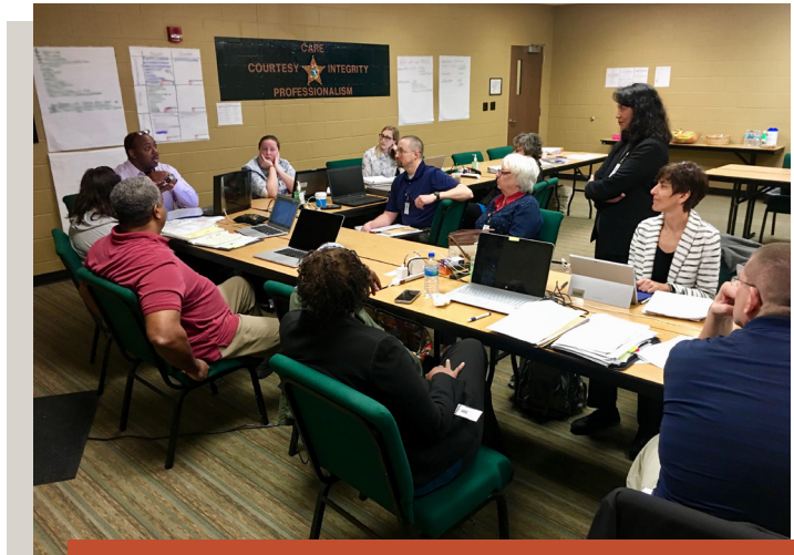
Field Training Program at Baker County Detention Center, February 2018.

These resources are maintained in a learning management system (LMS) called the PRC Training and Resource Portal that allows the PRC to provide continuing education courses and resources to certified auditors and track their participation. The LMS enables PMO to assess whether an auditor has met recertification requirements when an auditor’s three-year recertification is due. The LMS also allows the PRC to distribute and track pre-training coursework for the Auditor Training. The PRC revised the pre-training coursework for the May 2018 Auditor Training to reflect updates to the curricula based on the Auditor Handbook. The LMS allows the PRC to track versions of this training and monitor a trainee’s progress throughout the process.