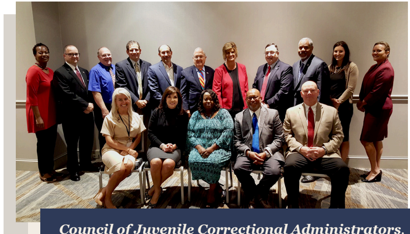
Council of Juvenile Correctional Administrators, PREA Juvenile Justice Leadership Institute

The PRC continues to communicate with critical juvenile and adult corrections, law enforcement, and victim advocacy stakeholders through e-blasts, webinars, conference presentations, and its website. The PRC sends regular email notifications to auditors advising them of training opportunities, DOJ guidance regarding standards interpretation, available resources, and reporting requirements. This past year, the PRC rebranded its communications materials to ensure clarity and effectiveness, and to increase readership.