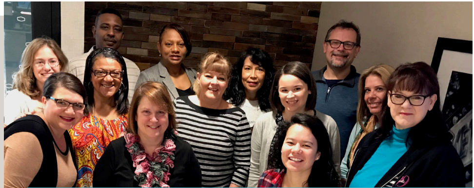
Field Training Program team at the Denver Sheriff's Department training program in October 2017.

That growing understanding and deepening experience with the implementation of the standards to prevent, detect, and respond to sexual abuse in confinement is a testament to the efforts of the DOJ in the years since the PREA standards were finalized, the work of the BJA's PREA Management Office (PMO), and the work that the PRC has accomplished under the office's guidance and leadership.